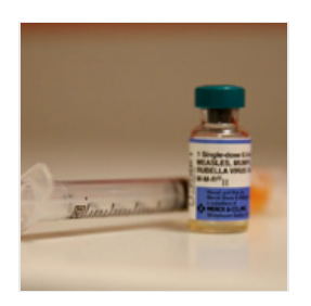
Poll Reveals Rift Between Scientists, Regular Folks

When it comes to food, energy, and education, Americans don't follow experts' lead.